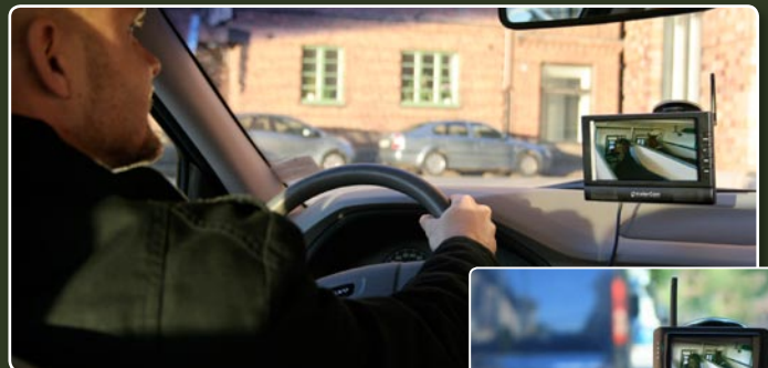
With the clear 3,6" or 7" LCD-monitor in the car cabin you can easily see that your horses are safe in the trailer.