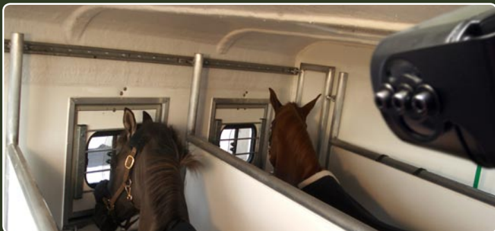
With trailerCam™ wide angle lens the camera covers several horses in the same picture.